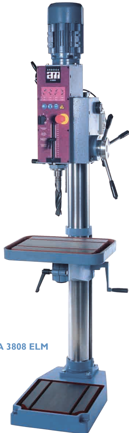
A 3808 ELM

Coolant complete with tubes, machine light halogen, chuck guard, micro switch for chuck guard, coordinate table 450 x 242 mm, coordinate table 584 x 242 mm (with or without automatic feed), threaded spindle nose with locking nut, automatic reversing unit for tapping, foot operated reversing switch, foot operated start switch, tool package MT 4